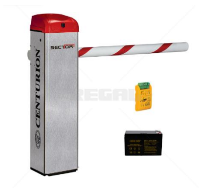
("SECTOR II 3m H/V Barrier Kit Brushed 316 Stainless Steel Round Pole")