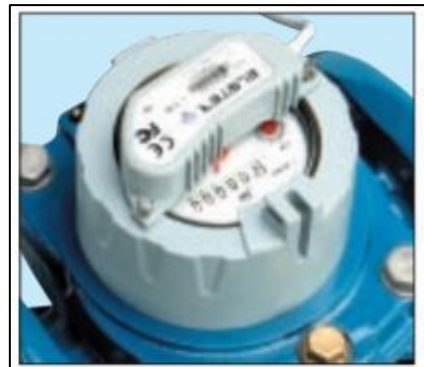
Bulk Water Meter with reader