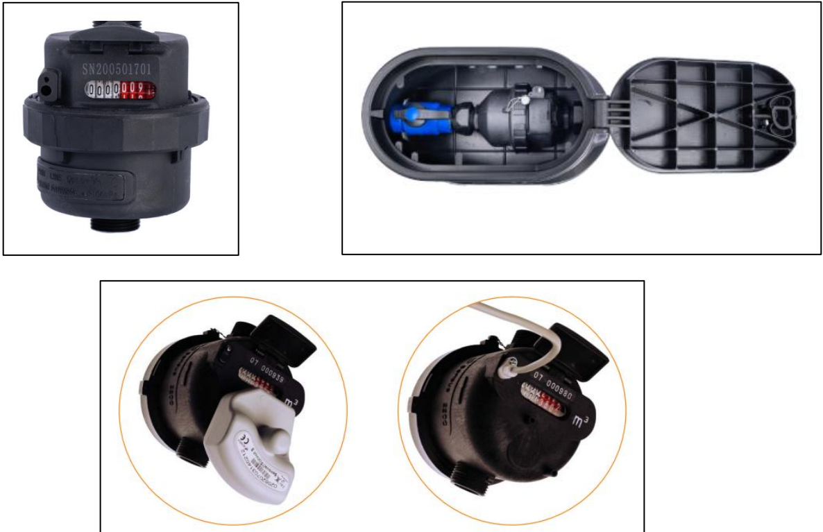
Domestic Water Meter with AMR-reader and Enclosure

Domestic Water meter sizes will range from 20mm to 25mm (sizes will be specified under each area). These water meters must be Approved for both horizontal and vertical installation inside Polymer Surface Water Meter Boxes (in ground/against pole or against housing unit).