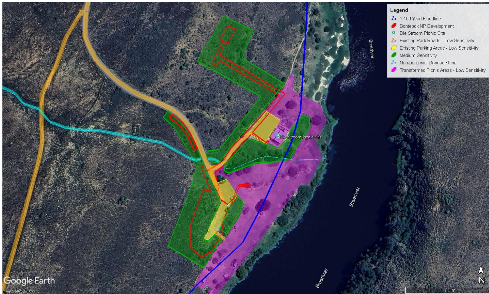
Map 2: Environment sensitivities map. Map Key: