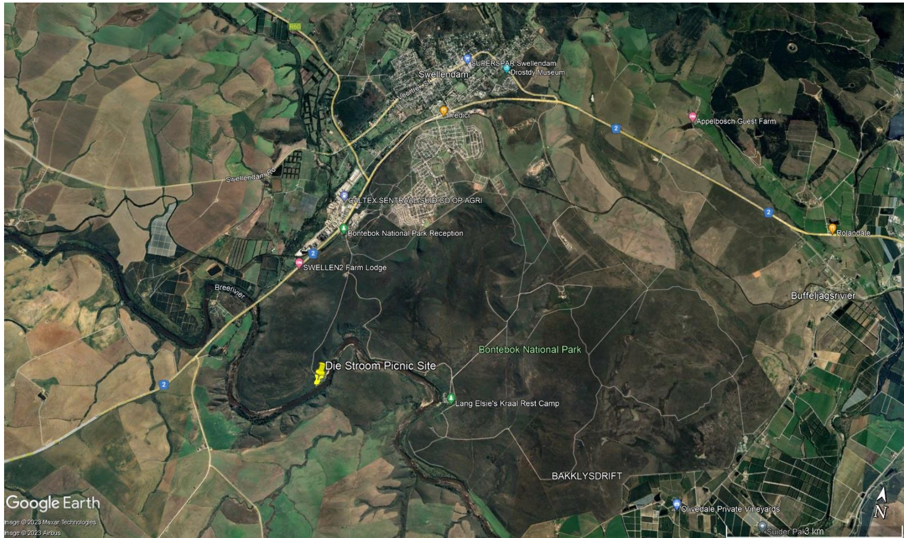
Map 2: Locality map for Die Stroom Picnic Site in the Bontebok National Park, Swellendam.