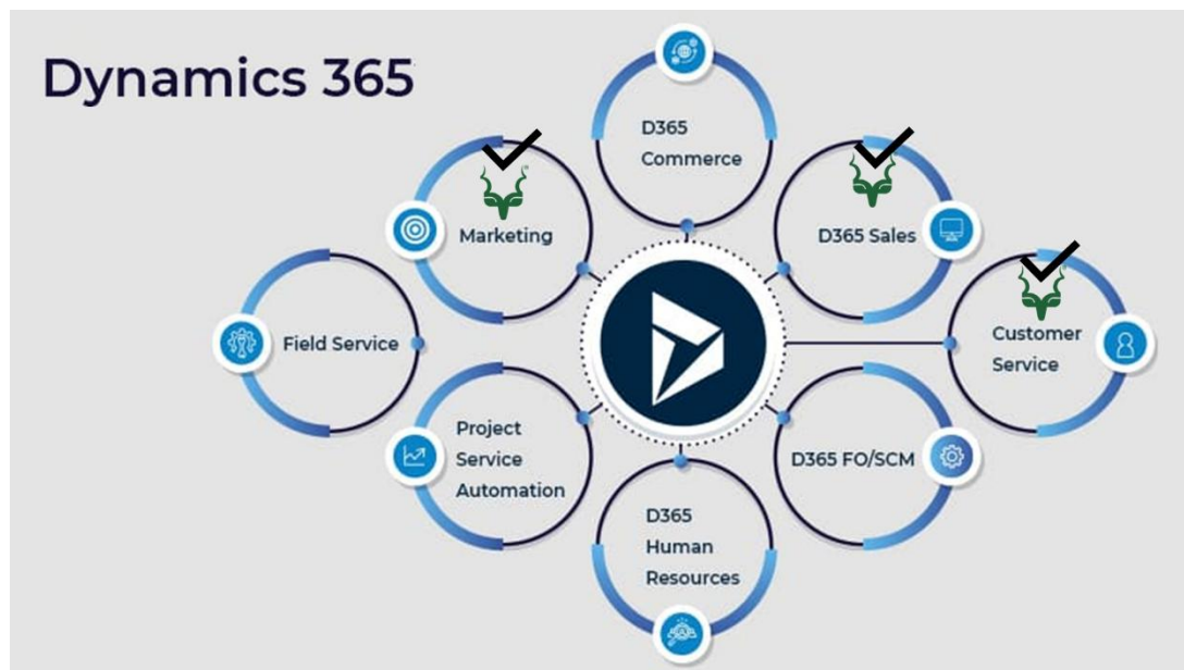
Figure 1 – D365 CRM modules activated for SANParks

SANParks has activated the Customer Service, Marketing and Sales modules of D365 CRM.