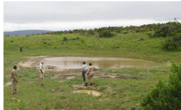
Managers and scientists are working together to develop an inventory of wetlands for Addo Elephant National Park. Here they are exploring a near-natural depression wetland on a mountain plateau in Nyathi Section.

Estuaries: South Africa has 290 estuaries and 42 micro-estuaries. These highly productive ecosystems comprise less than 2% of the country's territory but contribute R 4.2 billion per annum to our economy. This is the most threatened of all realms in South Africa, with only 18% of estuarine ecosystem types and 1% of the total estuarine area considered well protected. Nevertheless, most of the 22 estuaries that fall within or overlap with SANParks' estate are in a natural to near-natural ecological state, reflecting the higher protection level achieved through inclusion in a national park. Estuaries are prime examples of multiple-use common-pool resources, facing an array of pressures from surrounding uses of land, freshwater, coastal and marine ecosystems. Therefore, management and conservation of estuaries requires very clear definition, and execution, of roles and responsibility of all mandated and/or co-governing agencies.