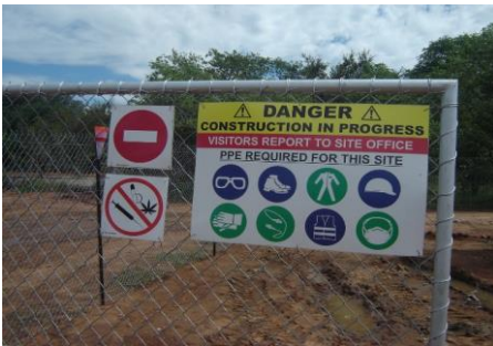
Warning signs are used on construction site.