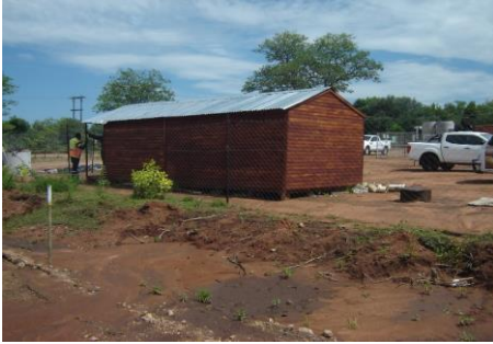
The laydown areas are fenced.