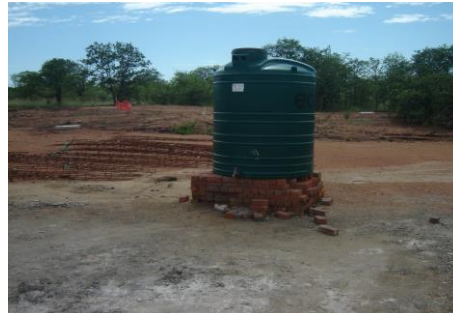
Water tank on building site.