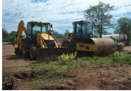
The laydown areas are fenced.