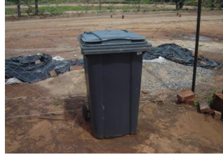
Waste bins are on site.