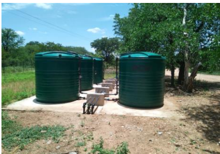
New jojo water tanks for Phalaborwa Gate.