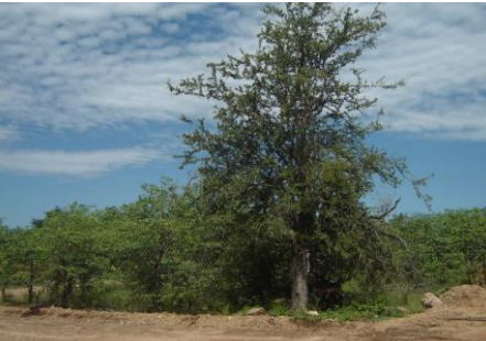
Leadwood Tree ( Combretum imberbe ) is a protected tree and will not be removed.