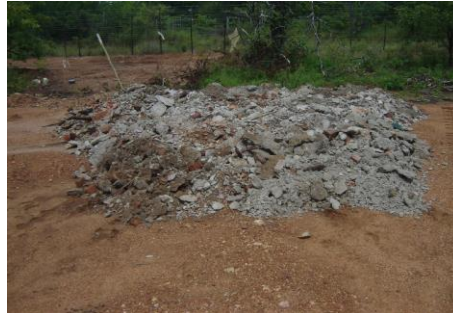
Building rubble must be removed from site.