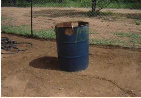
Waste bins are on site.