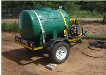
Water cart is on site.