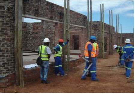
The workers are issued with PPE.