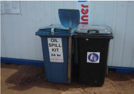
Spill kit and dust bins are on site.