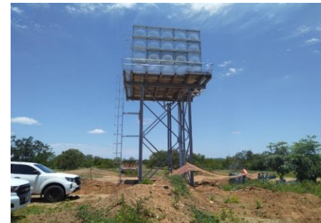
New elevated water tank for the Phalaborwa staff village.