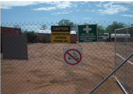
Warning signs are used on construction site.