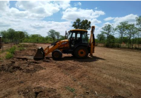
Excavater on site.