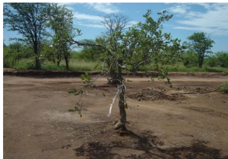
Apple Leaf Tree ( Philenoptera violacea ) is a protected tree and will not be removed.