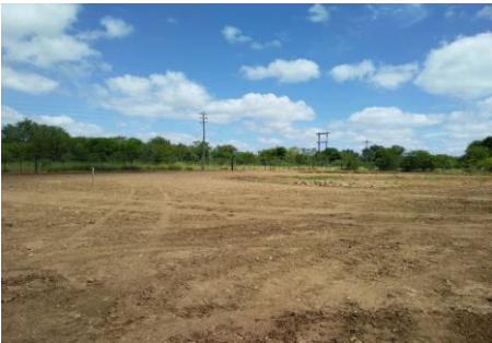
Parking areas are cleared. Only the demarcated areas were cleared.