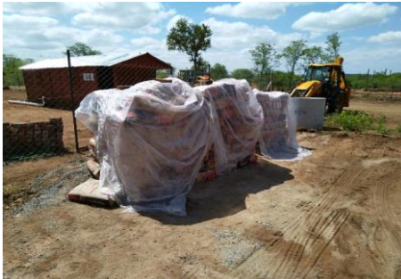
Cement on site.