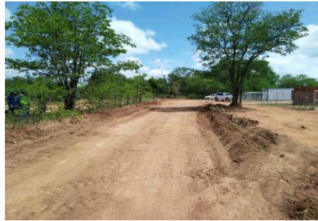
Trees were remain where possible.