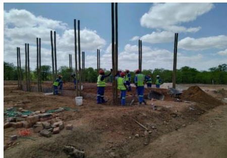
The workers are issued with PPE.