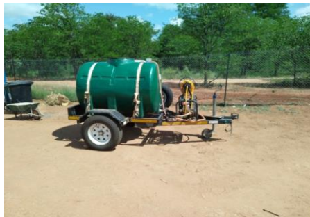
Water cart is on site.