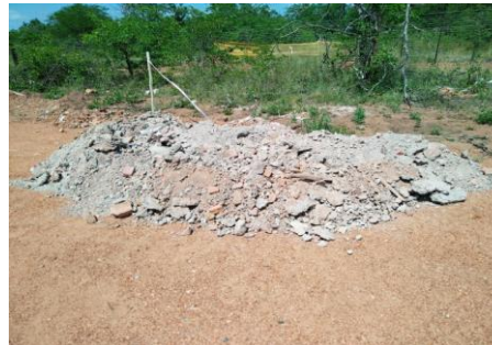
Building rubble must be removed from site.