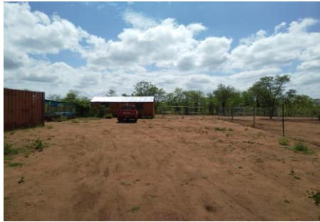
The laydown areas are fenced.