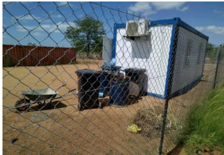
Spill kit and dust bins are on site.