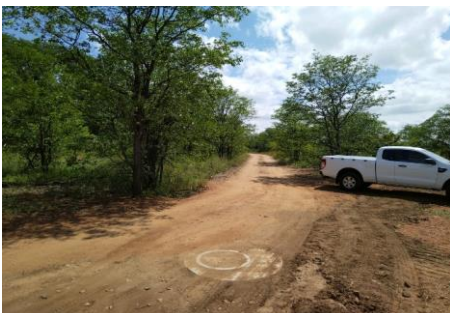
Existing roads will be used where possible.