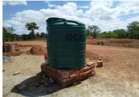
Water tank on building site.