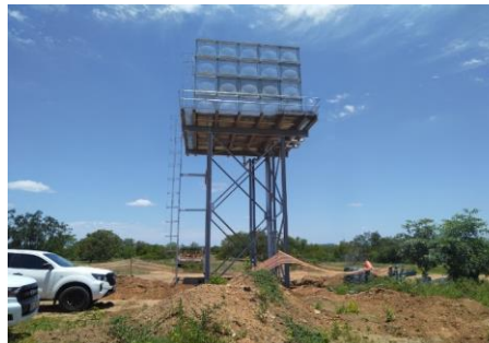
New elevated water tank for the Phalaborwa staff village.