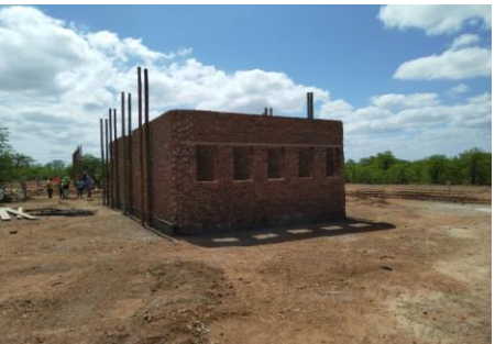
Construction of office building.