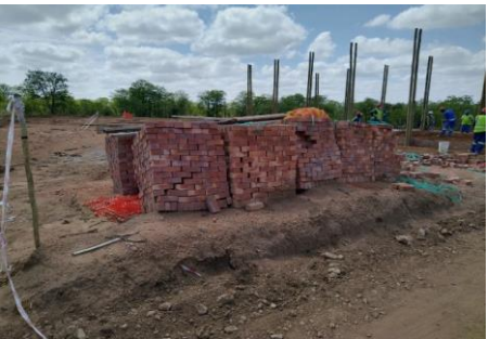
Building bricks on site.