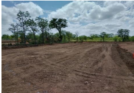
Parking areas are cleared. Only the demarcated areas were cleared.