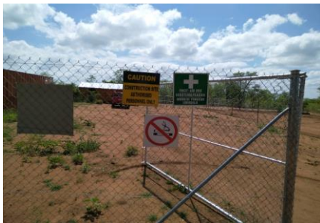
Warning signs are used on construction site.