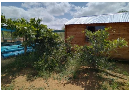
Apple Leaf Tree ( Philenoptera violacea ) is a protected tree and will not be removed.