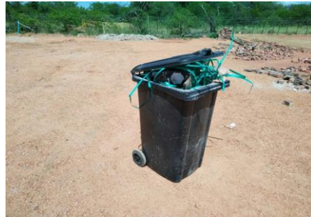
Waste bins are on site. It must be emptied regularly.