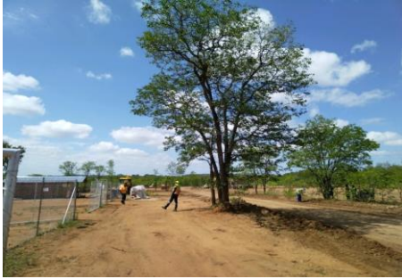
Trees were remain where possible.