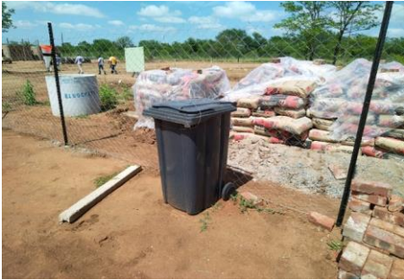
Waste bins are on site.