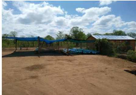
The laydown areas are fenced.