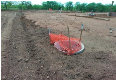
Open man hole is barricaded.