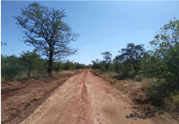
Existing access road is use for acces to the construction site.