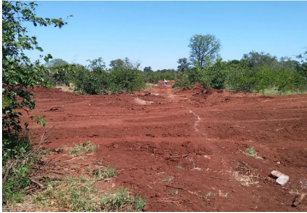
Trenches for the sewer pipeline are closed.