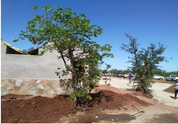
Mopani Trees were remained outside construction site.