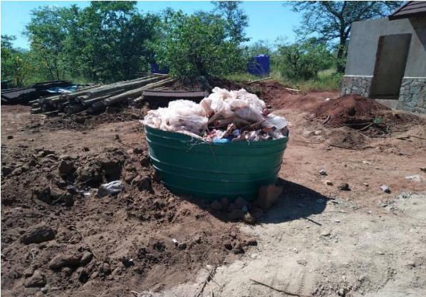
Waste containers must be emptied regularly.