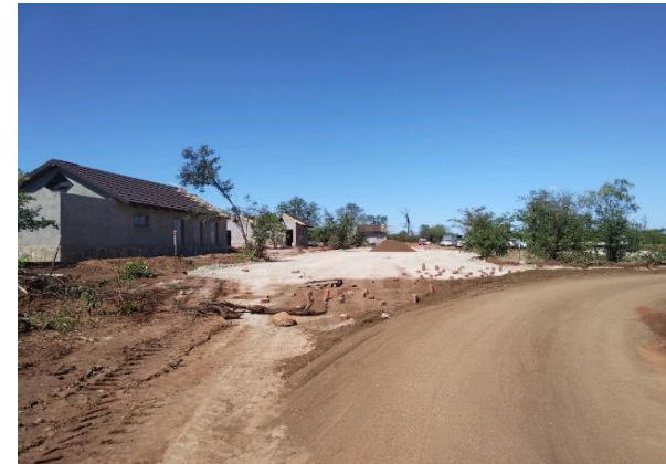
Existing access road is use for acces to the construction site.