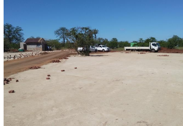
The parking area is cleared.