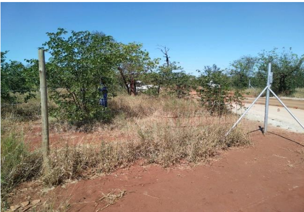
The construction area is temporary fenced.