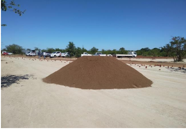
The parking area is cleared.