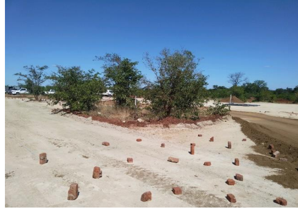
Mopani Trees were remained outside construction site.