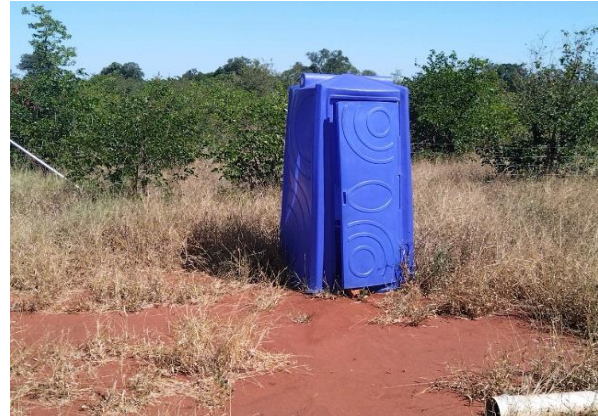
Portable toilets at construction site (Reception Site).