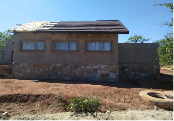
Harvey tiles are used for the roof instead of thatch grass.