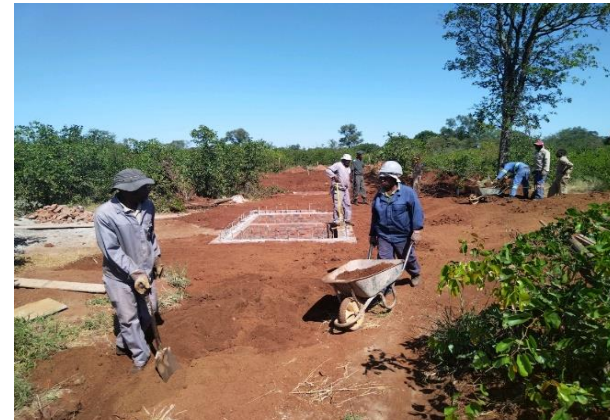
The workers are issued with PPE.