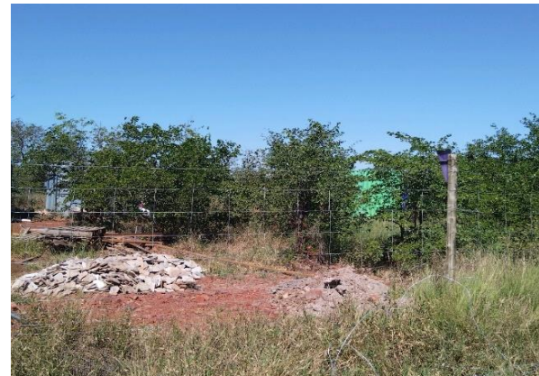
The construction area is temporary fenced.