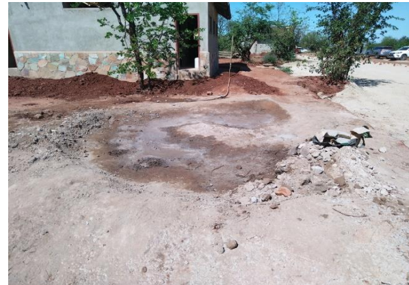
Concrete is mixed on impermeable surface.