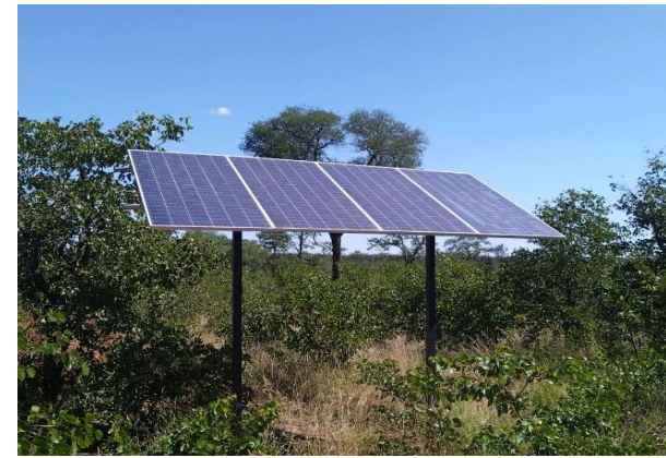
Solar pannels for new borehole.