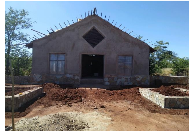
The contractor is busy with the construction of the buildings.