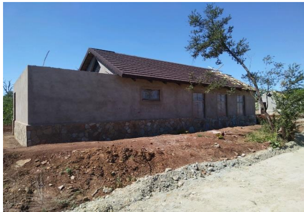
The contractor is busy with the construction of the buildings.