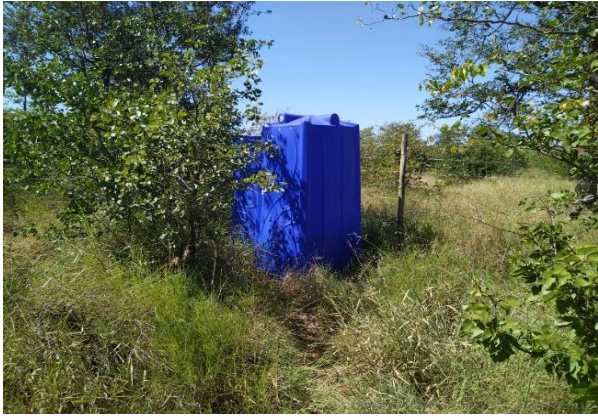
Portable toilets at construction site (Reception Site).