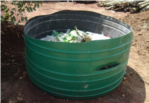
Waste containers are available on site.