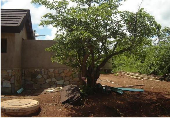
Mopani Trees were remained outside construction site.