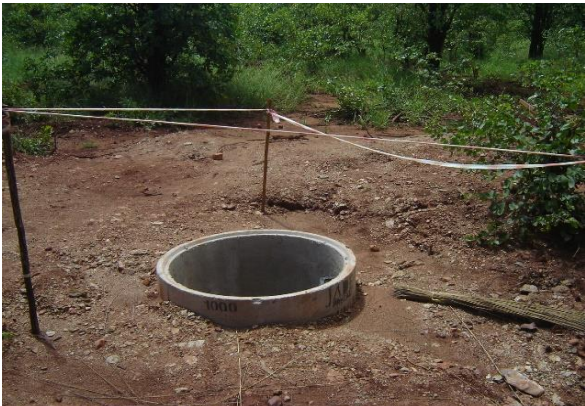
Danger tape is erected on site.