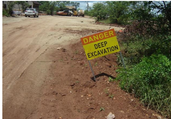
Warning signs are erected on site.