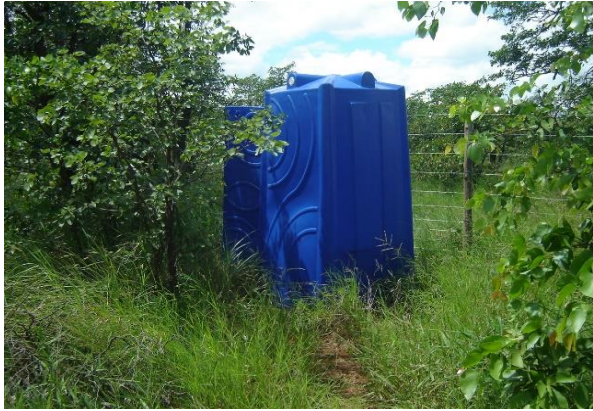
Portable toilets at construction site (Reception Site).