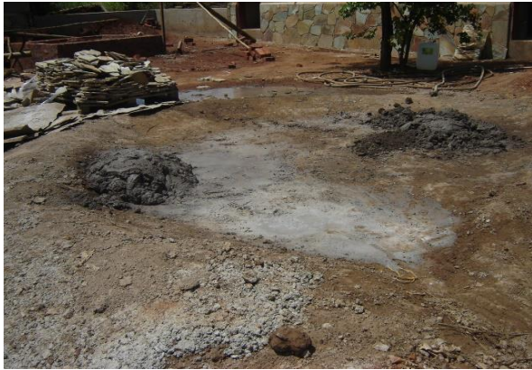
Concrete is mixed on impermeable surface.