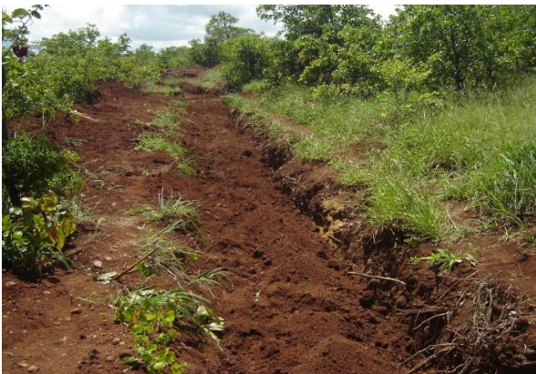
Trenches for the sewer pipeline.