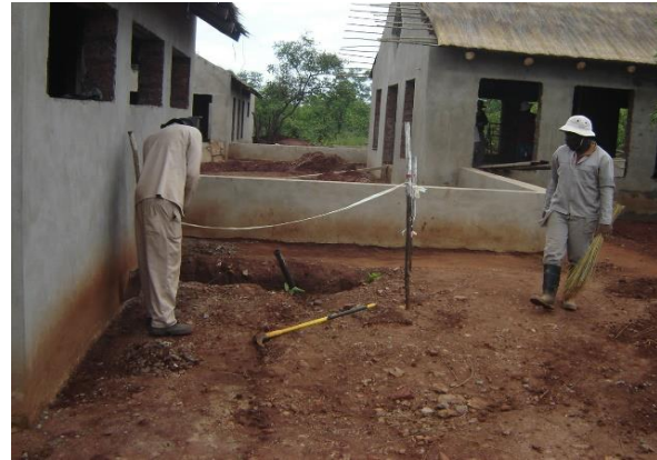
The workers are issued with PPE.