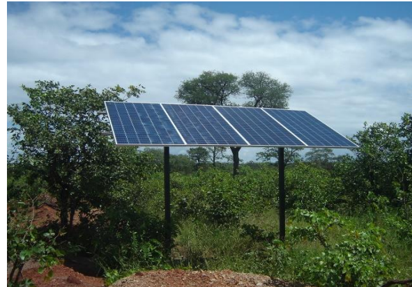
Solar pannels for new borehole.