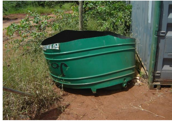
Waste containers are available on site.