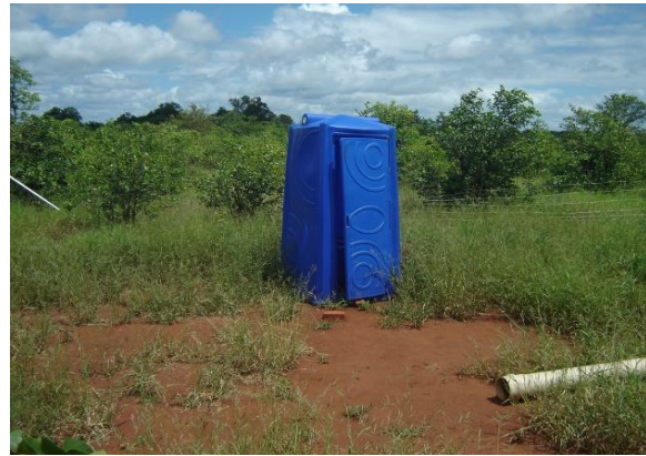
Portable toilets at construction site (Reception Site).