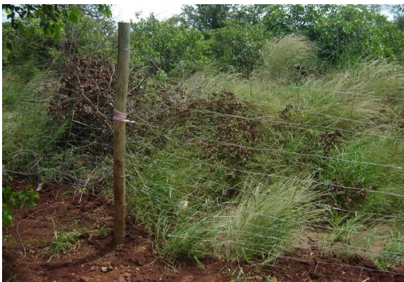
The construction area is temporary fenced.