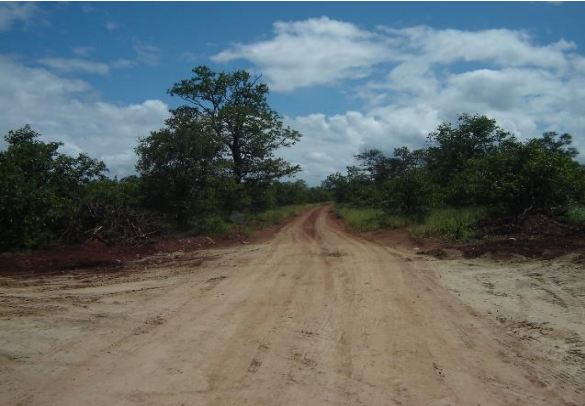
Existing access road is use for acces to the construction site.