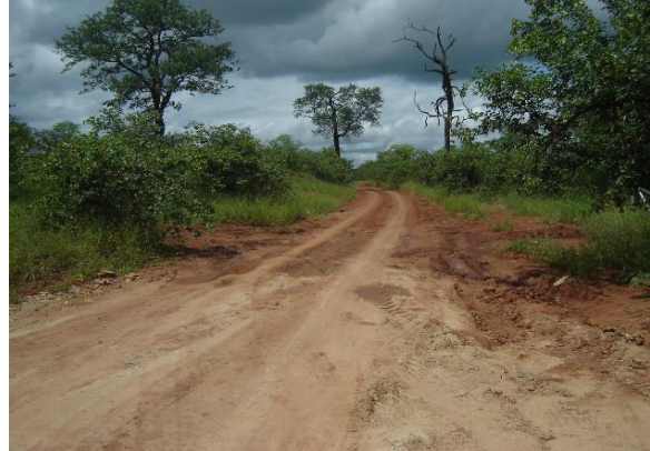
Existing access road is use for acces to the construction site.