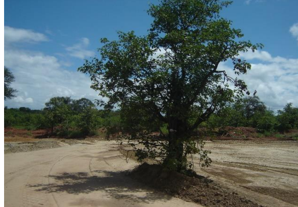
Mopani Trees were remained outside construction site.