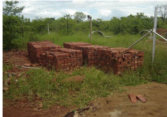
The construction area is temporary fenced.