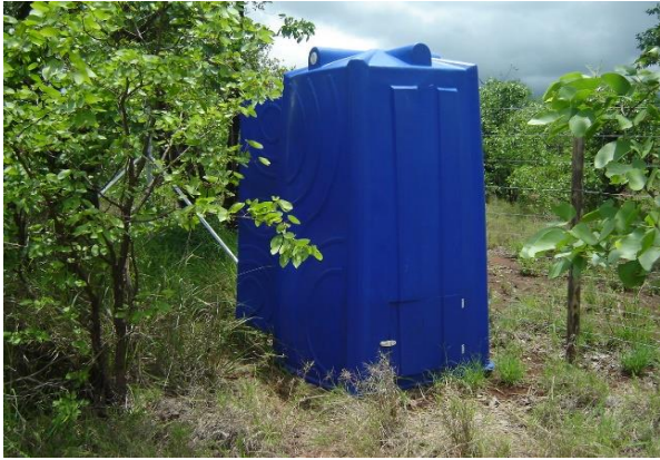
Portable toilets at construction site (Reception Site).