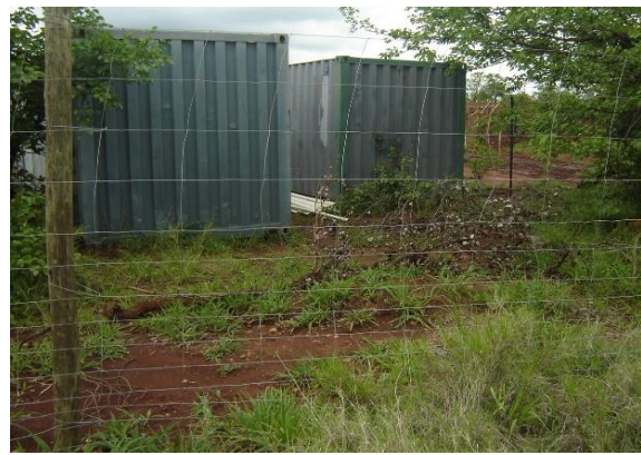
The construction area is temporary fenced.