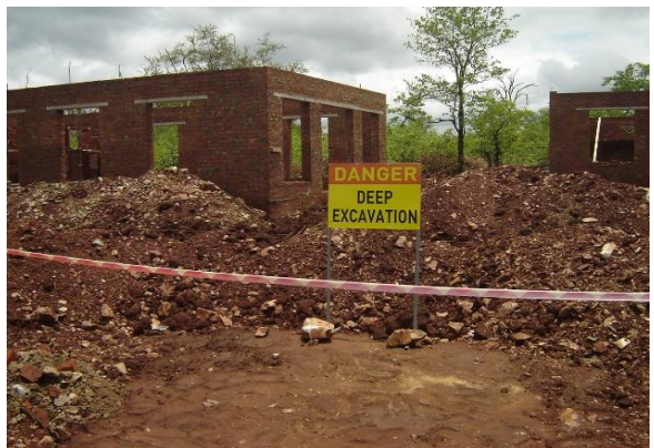
Danger tape and warning signs are erected on site.