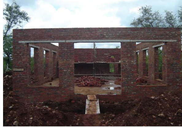
The contractor started with the construction of the buildings.