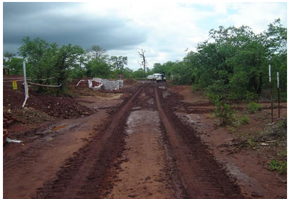
Existing access road is use for acces to the construction site.