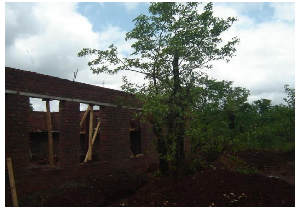
Mopani Trees were remained outside construction site.