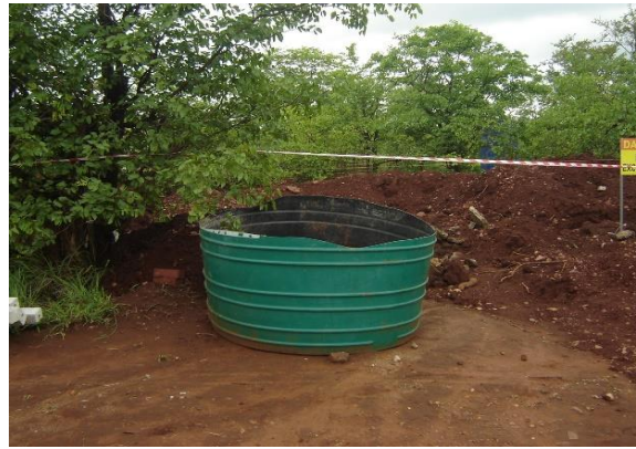
Waste containers are available on site.