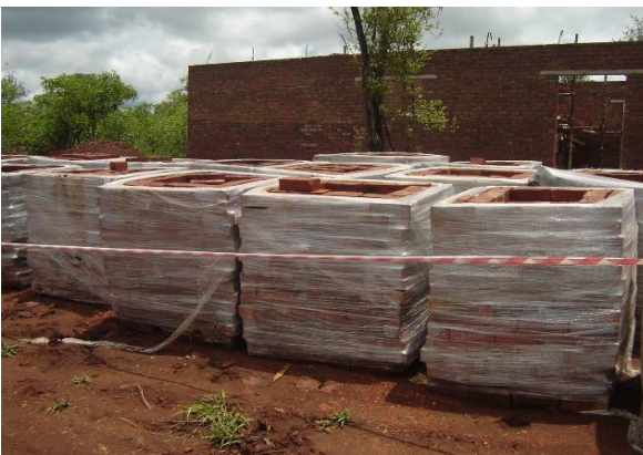
Building bricks are on site.