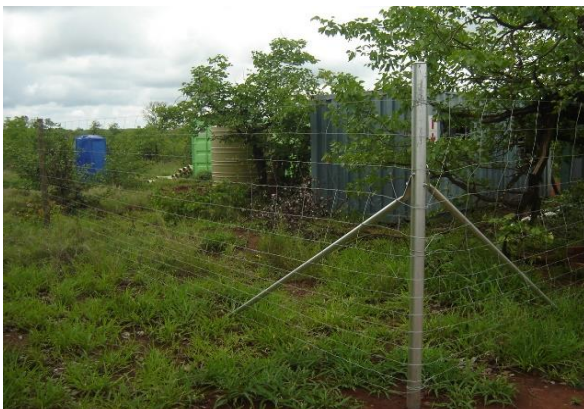
The construction area is temporary fenced.