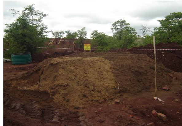
Building sand is on site.