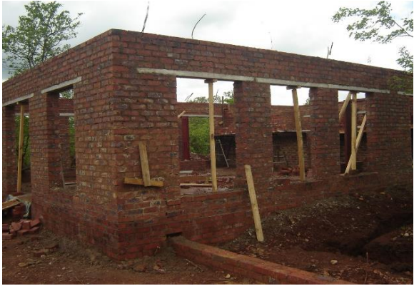
The contractor started with the construction of the buildings.