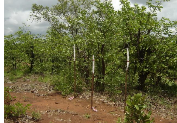
The parking area is pegged.