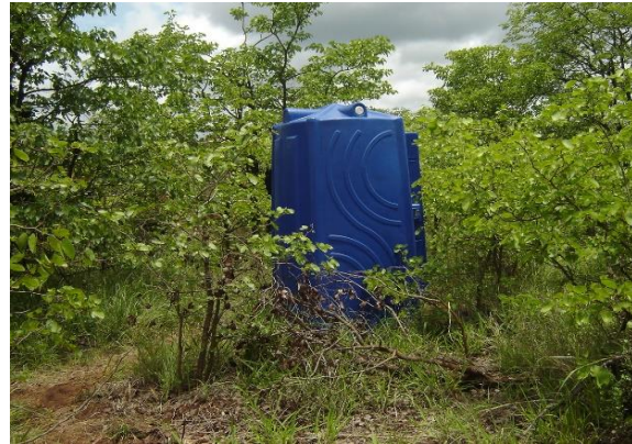
Portable toilets at construction site (Reception Site).