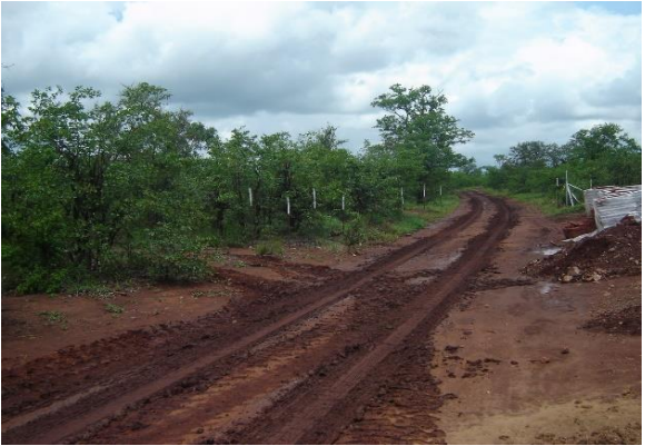
The parking area is pegged.