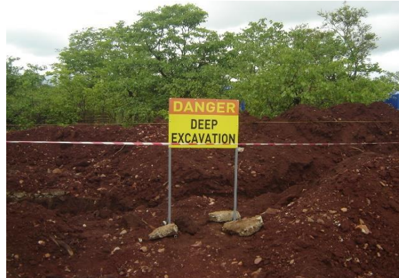
Danger tape and warning signs are erected on site.