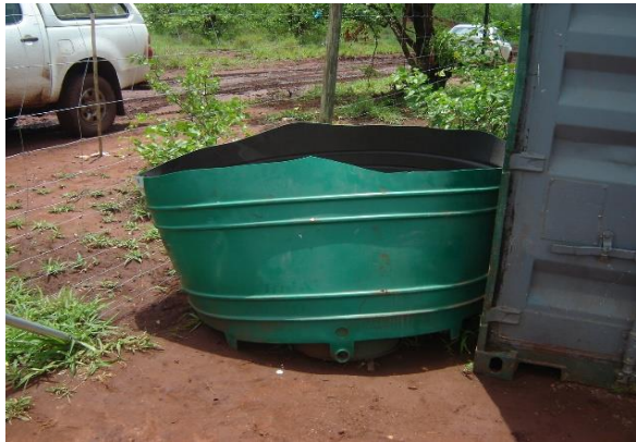
Waste containers are available on site.