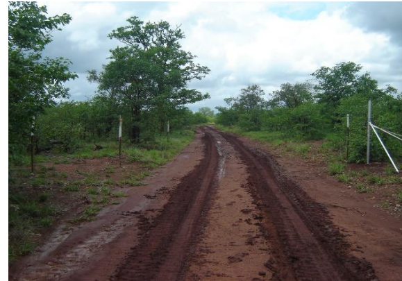
Existing access road is use for acces to the construction site.