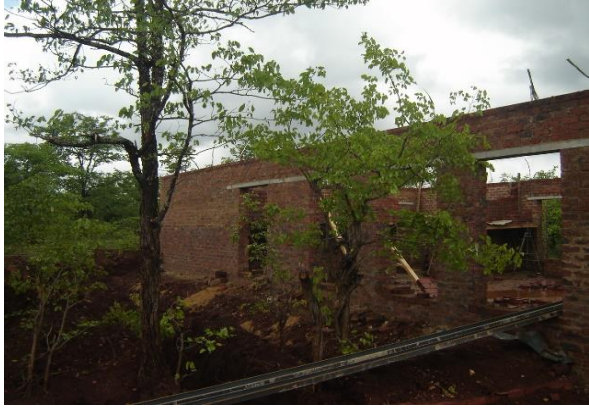
Mopani Trees were remained outside construction site.