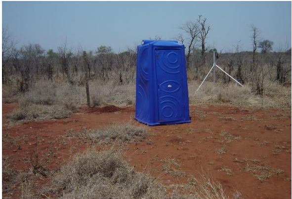
Portable toilets at construction site (Reception Site).