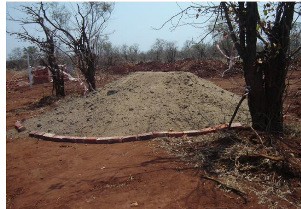
Building sand is on site.