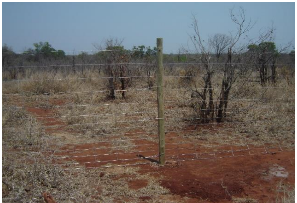
The construction area is temporary fenced.