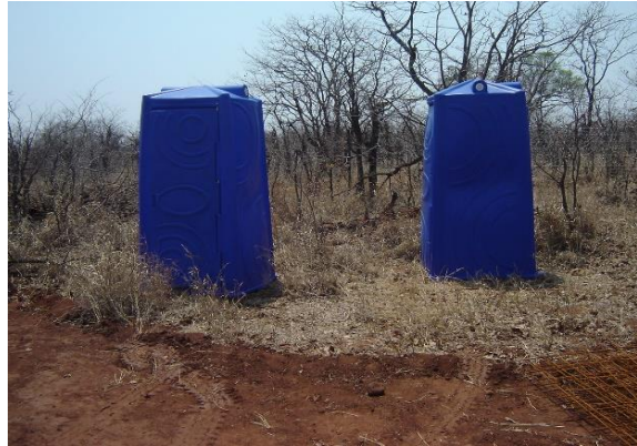
Portable toilets at construction site (Reception Site).