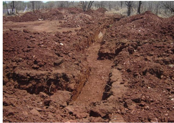
The foundations are excavated.