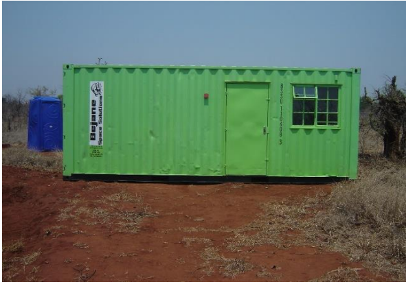
Container housing construction tools.