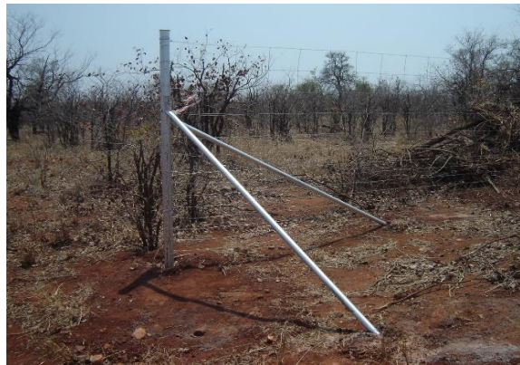
The construction area is temporary fenced.