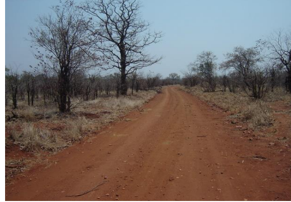
Existing access road is use for acces to the construction site.