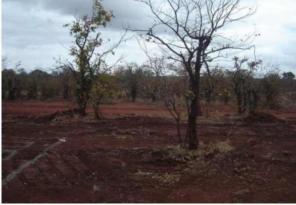
Mopani Trees were remained outside construction site.