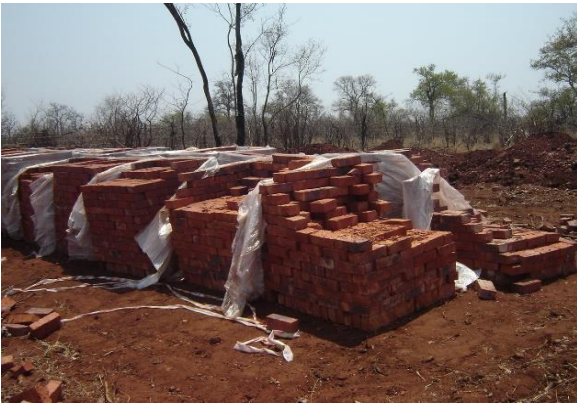
Building bricks are on site.