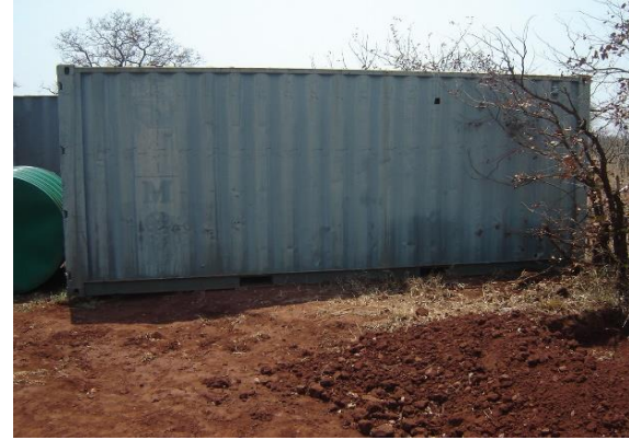
Container housing construction tools.