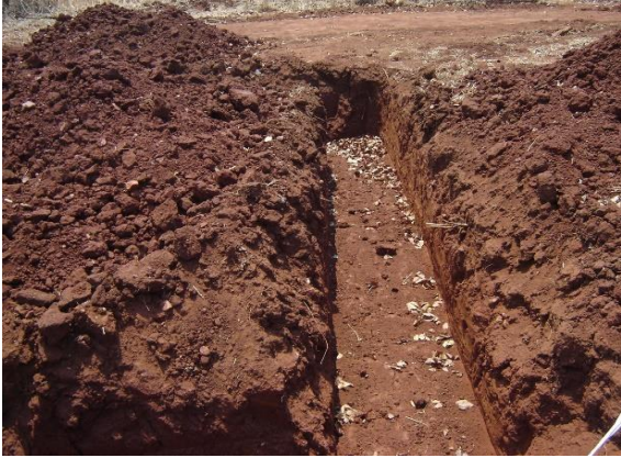
The foundations are excavated.