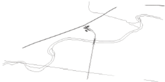
RECEPTION BUILDING IN RELATION TO THE RIVER AND THE T-JUNCTION