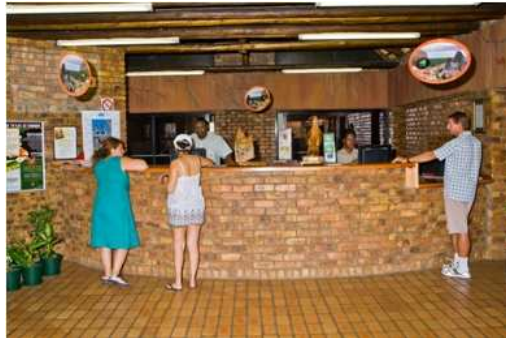
Reception Counter with lowered portion on right

On arriving at the camp the parking area at the main reception/restaurant/shop complex has no designated wheelchair bays, but a suitable location can usually be found with sufficient space to disembark. The entire camp is bricked (apart from the tar entrance road) and this means there is a suitable surface for wheelchair travel around the camp. All the main facilities are accessible lowered portion at the reception counter is a nice feature – the information centre/rhino exhibition hall adjacent the reception area is worth spending some time browsing the displays.