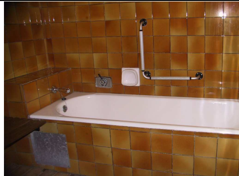
Campsite bath with grab rail

The two family cottages each sleep 6. These two units ablutions differ, with one having a roll-in shower, the other a bath with grab rails. The toilets are not adjacent a wall, so wall-to-ground rails have been provided. The basin vanity has great clearance underneath and the basin has push lever taps as depicted in the pictures below.