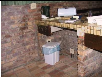
Good clearance below the hotplates and work surface

The accessible family cottage kitchens have good and bad features. The pantry shelves are easy to access, and underneath the hotplates there is great clearance for wheelchair users' legs. However there are boards beneath the sinks that mean wheelchair users must park sideways in an uncomfortable manner to use the sink properly.