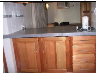
The breakfast bar from the kitchen side

Like the Kitchen the Ablutions are very spacious. The toilet has grab rails in the appropriate position and the sink importantly is within reach of someone sitting on the toilet