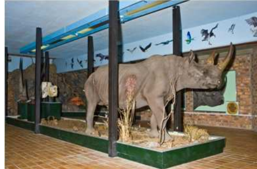
The Rhino Hall

The camp's main feature is that it overlooks the Matjulu Dam. This is great for viewing wildlife and the whole frontage overlooking the dam is fully accessible, with many vantage points for watching the activity around the dam. This is also the starting point for "the rhino trail" which is an in-camp perimeter trail which has a guide rope and Braille notice-boards for visually impaired guests and is wheelchair accessible for a portion of its distance along the camp's fence bordering the dam, although a steep descent from the paved area in front of the restaurant and some wheelers may require assistance here or at the other exit point some 50m along the fence.