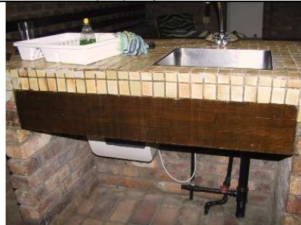
Board preventing access below the sink

Accessible Bungalow: For many years the only units accessible to people in wheelchairs that were available in Berg-en-Dal were the two 6 bed family cottages. These units are often too large and expensive for people with disabilities, particularly if they are traveling alone or with one or two companions. Since early 2009 however a 3-bed bungalow has been added to the accessible units in the camp and this unit is on the camp's fence line – ideal for watching passing wildlife. The unit has parking in front of the unit of the required width and the pathway is sufficiently wide, firm, smooth and even to allow for easy passage in a wheelchair.