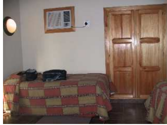
A difficult cupboard to access