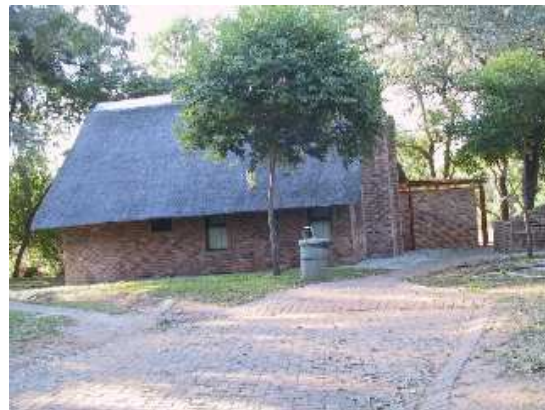
Accessible bungalow depicting access path and parking

Accessible Bungalow: For many years the only units accessible to people in wheelchairs that were available in Berg-en-Dal were the two 6 bed family cottages. These units are often too large and expensive for people with disabilities, particularly if they are traveling alone or with one or two companions. Since early 2009 however a 3-bed bungalow has been added to the accessible units in the camp and this unit is on the camp's fence line – ideal for watching passing wildlife. The unit has parking in front of the unit of the required width and the pathway is sufficiently wide, firm, smooth and even to allow for easy passage in a wheelchair.