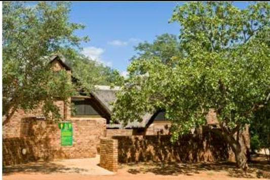
Entrance to the accessible campsite ablutions

ACCESSIBLE ACCOMMODATION: There are three accommodation units with accessible adaptations out of 80 odd units in the camp. Of these three, two are 6-bed family cottages and one a 3-bed bungalow. There are also accessible ablutions in one of the three campsite ablutions, but there is only a bath and toilet with grab rails and not a roll-in shower.