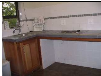
Work bench and hotplates with clearance underneath

Once inside however the kitchen is very spacious and accessible. It is great to have hotplates and a work surface with clearance underneath and plugs that are easily reachable and while there isn't clearance beneath the sink, the sink does have push lever taps.