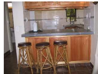
The breakfast bar from the bedroom